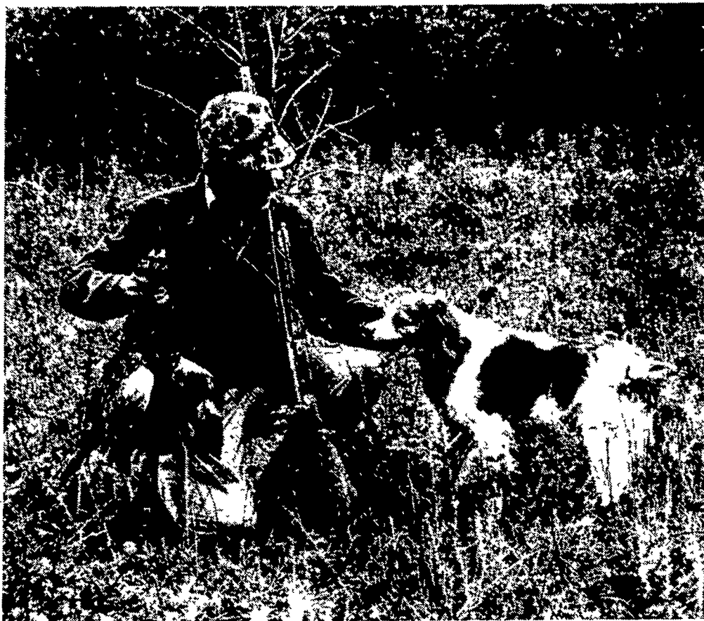
Safe hunting is no accident. Keep this hunting season a happy memory .. think before you shoot.

-Never change locations with the engine running.