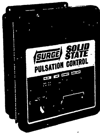
SURGE SOLID-STATE PULSER