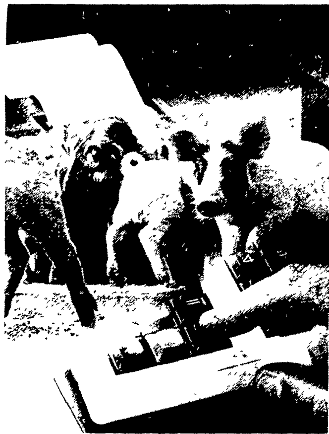
Figure it for yourself. You get them on feed at half the cost with our pre-starter.

The difference is dramatic. You save half the cost of a commercial pre-starter when you build your own with Vigortone's Creep Wean No. 3.