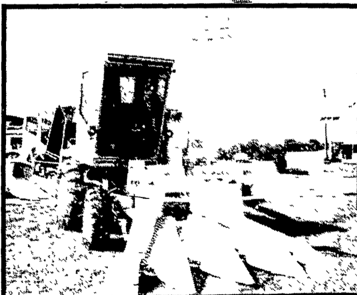
Field Queen 7650 Forage Harvester 4 Wheel Drive, 4 Row Head