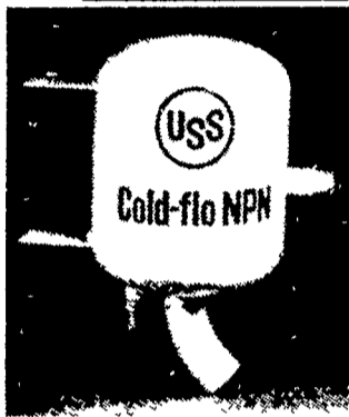
USS Cold flo NPN Converter

Add 7 lbs. of Anhydrous Ammonia Via Cold-Flo and increase protein content of Silage by 4%