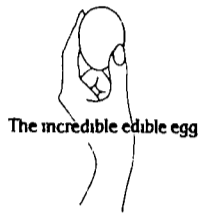
The incredible edible egg

BARN PAINTING Call Us Now For Free Estimates PHARES S. HURST RD 1, Box 420 Narvon, Pa 17555 215-445-6186