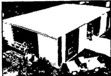
FARMSTED II AND