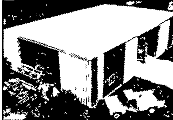
FARMSTED II AND