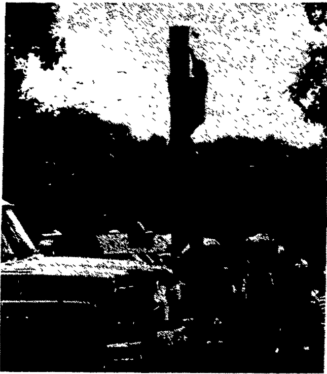
Ever think you'd like to be a lumberjack? Well, people had the chance last weekend to see just how quickly they could scale this tree trunk.