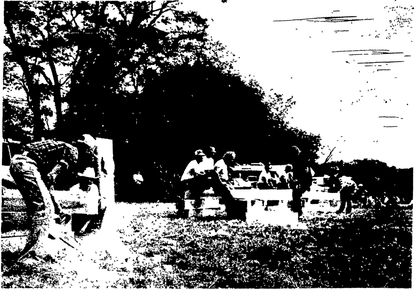
Chain saw competition saw a big turnout in the amateur division. Each man had to make two cuts

crossroads by going straight ahead, and going past golf course and at the next intersection go straight ahead. When one comes to the third intersection, which is a deadend, turn right and the farm is located 1/2 mile on left.