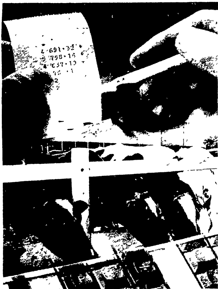
Figure it for yourself. When you shortchange their nutrition, you shortchange yourself.

Valley Stockyards Athens, Pa. Monday, September 10 Reported receipts of 488 calves, 158 cows, 20 heifers, 18 bulls, 7 steers, 65 hogs, 4 sheep, and 1 lamb. Cattle market reported higher and calf market steady. Holstein heifer calves to 175.00; veals 85.00-118.00;