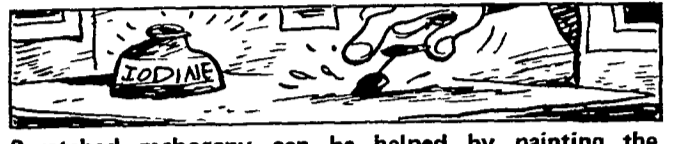
Scatched mahogany can be helped by painting the scratches with iodine, then polishing.