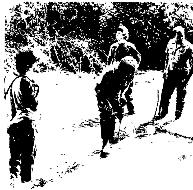
Slowly the stream devise takes form, as the two logs are j water.