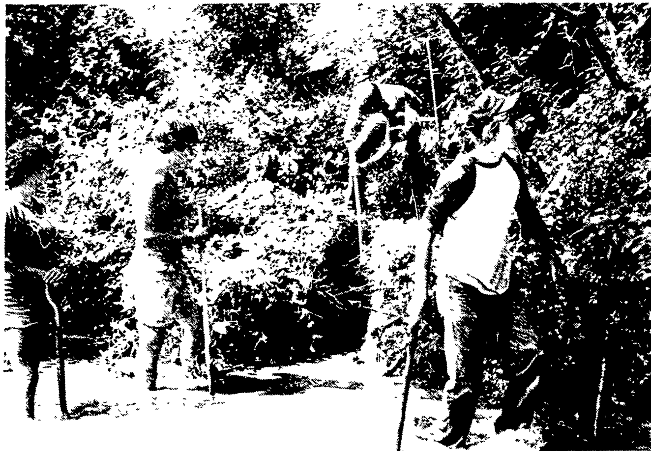
One of the first steps of building the stream improvement devise was to dig a trench back into the bank. Here conservation camp members take