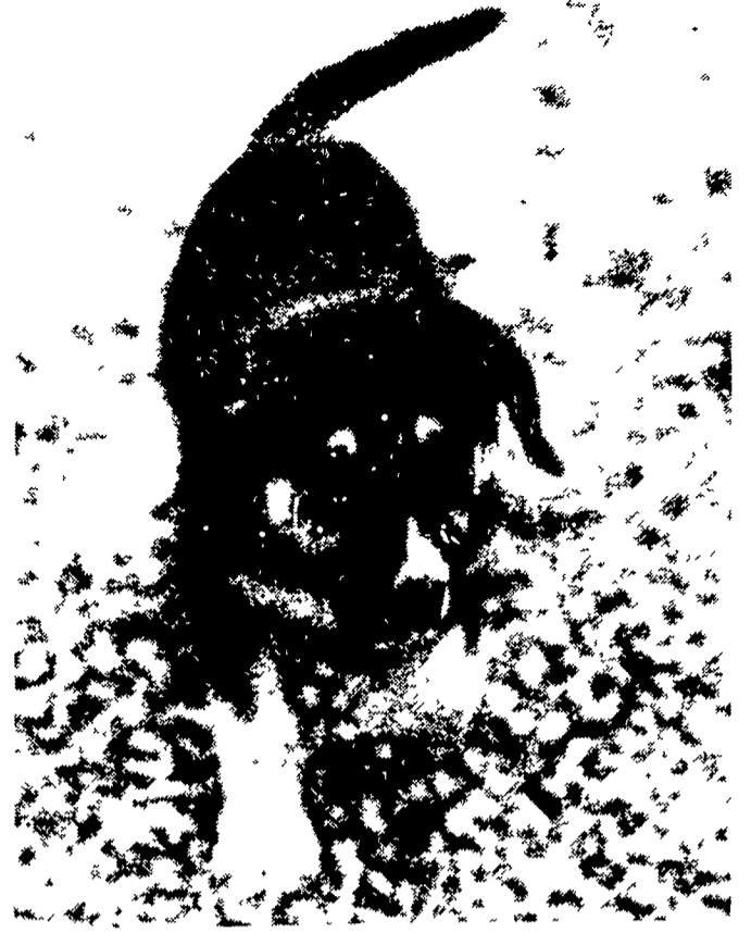
Shiloh is just one of those puppies that believes the world is a great big happy place to enjoy.

How can anybody resist such an optimistic approach to life?