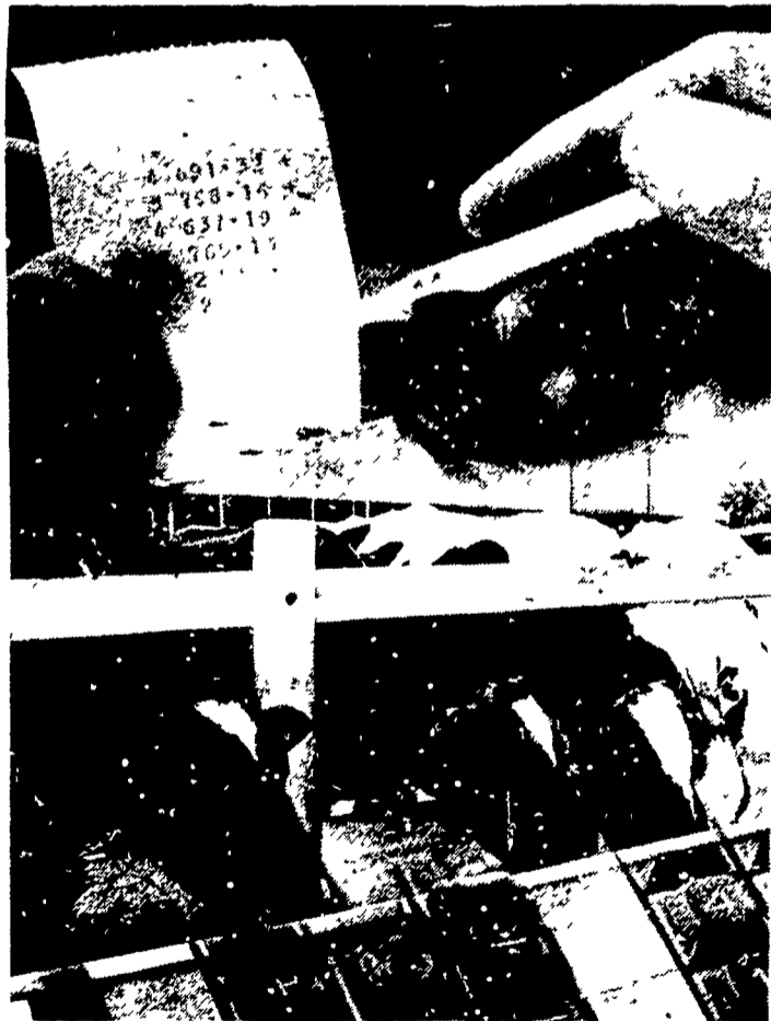
Figure it for yourself.

R.D. 2, Rock Road, Honey Brook, PA 19344 For more information call: (215) 273-3211