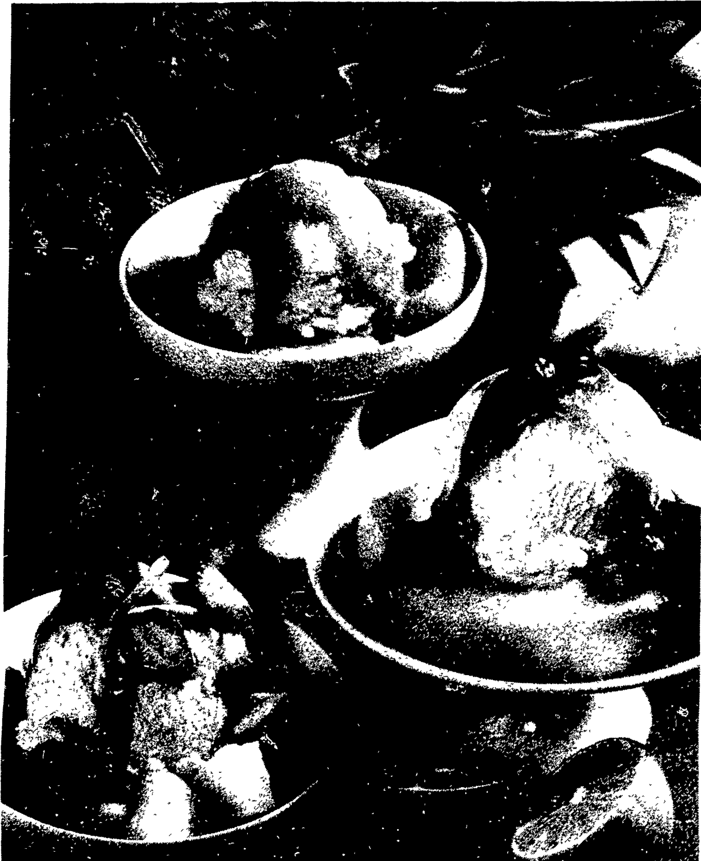
From sundae to sundae, you can enjoy ice cream of many flavors sauced with your favorite fruit or berries. The combination makes a perfect treat for any Summer day.

Today people can enjoy sundaes, any day, Sundays included. For a real treat, a person can make his own ice cream from wholesome, (Turn to Page 19)