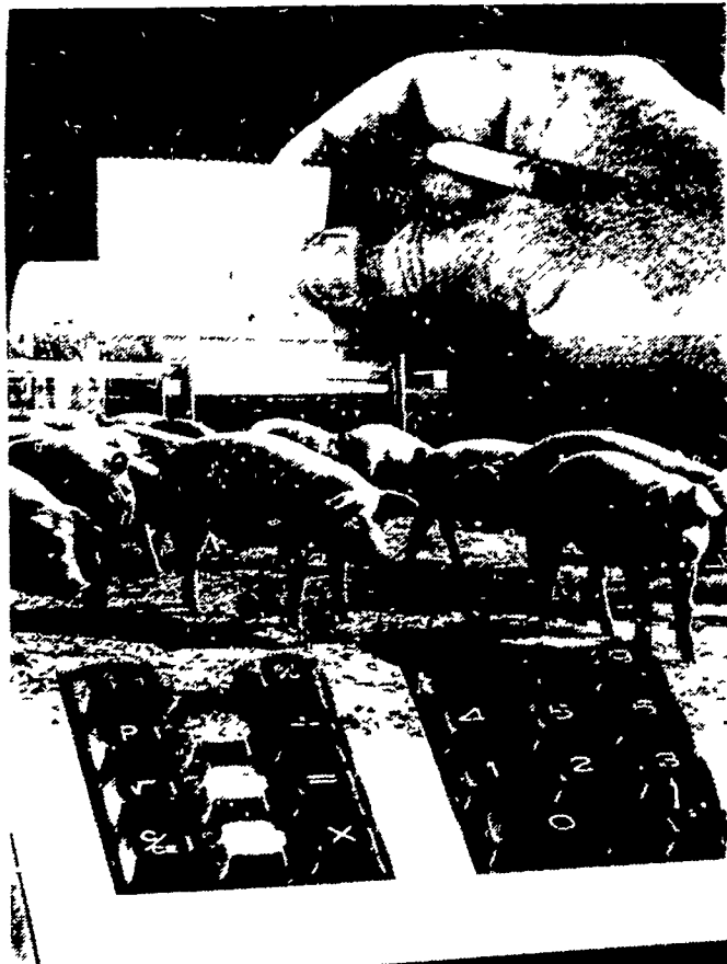
Figure it for yourself. You save money, day after day, with corn-soy and Vigortone.

Want to save money on your swine rations? When you take charge of ration content and quality, you start saving from the very first day.