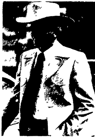
THE MAN WITH THE DETROIT CONNECTION

When you take advantage of a great deal on a great Dodge vehicle from JACK LOWRY DODGE. This facsimile of a $300 check awaits only validation by a JACK LOWRY DODGE representative following your purchase of any of these 1979 Dodge vehicles: St. Regis, Magnum, 2 and 4 wheel drive domestic pickups, vans, Sportsman models and Ramchargers. DUE TO TREMENDOUS RESPONSE THIS OFFER IS BEING CONTINUED.