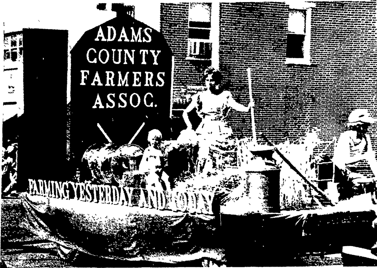
The Adams County Farmers Association took top honors in the float competition at the Annual Firemen's Parade in Gettysburg on July 7. The