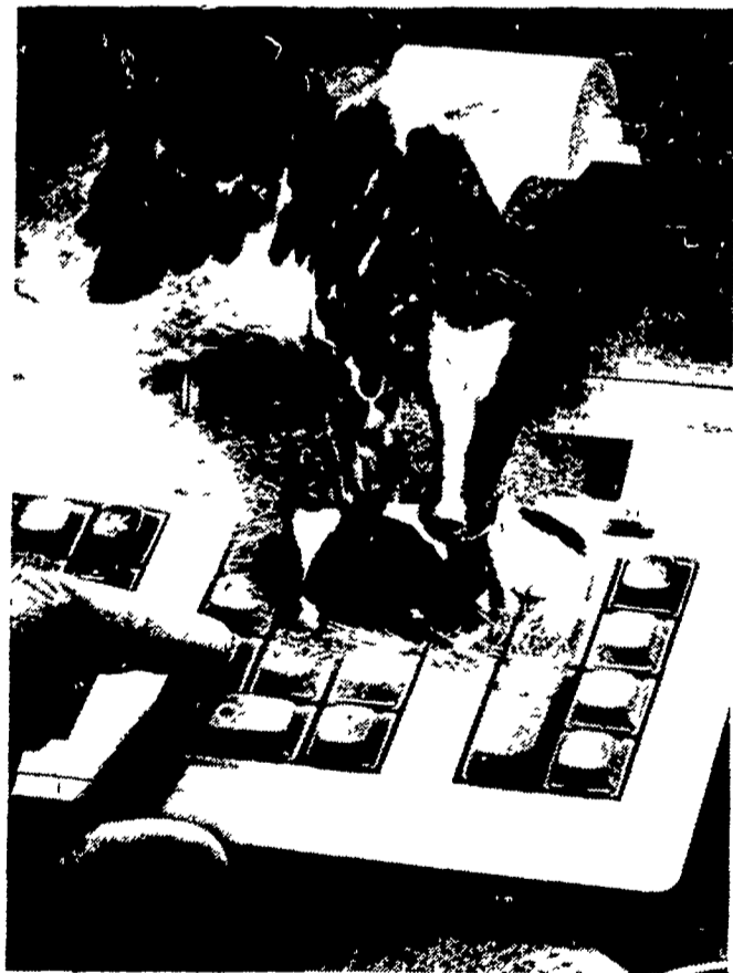
Figure it for yourself.