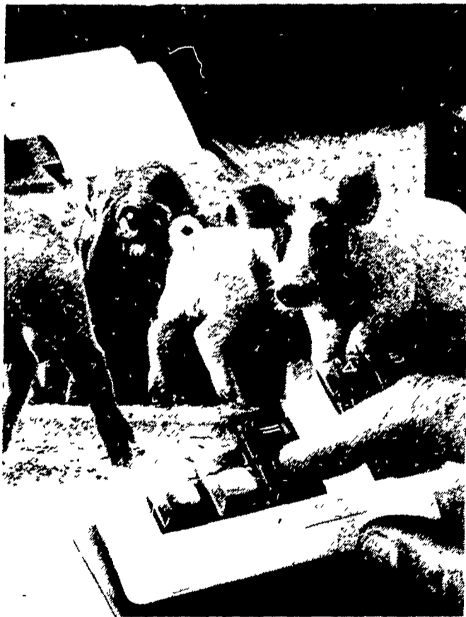
Figure it for yourself.

Cliff Holloway Rt 1 Peach Bottom, PA 17563 717-548-2640