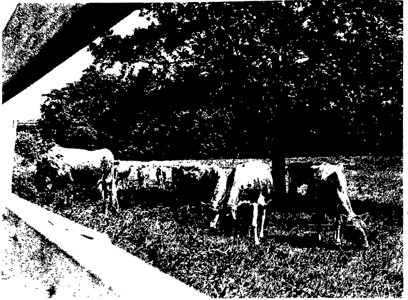
The Witmers have 65 Guernseys on test. They like the higher butterfat differential their breed gives.

Unit-built gangs make them the toughest you can buy