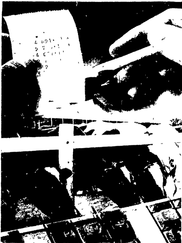
Figure it for yourself. When you shortchange their nutrition, you shortchange yourself.

Looking for ways to cut on down on out-of-pocket feed costs without cutting down on milk production? Cutting production costs will backfire if you end up shortchanging your herd's nutrition in the process.