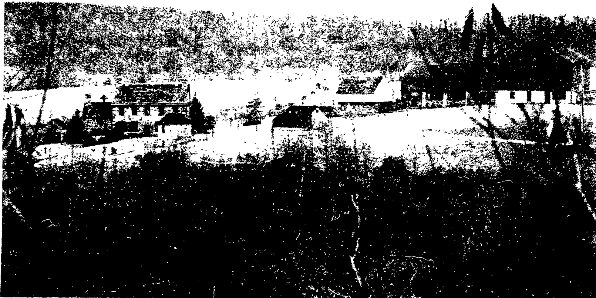
Historic Warwick Furnace Farm in Chester County causes more than a casual glance by those who pass by.