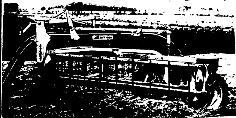
Ezee-Flow Hay Rake w/rubber flex teeth 1 only at $1395