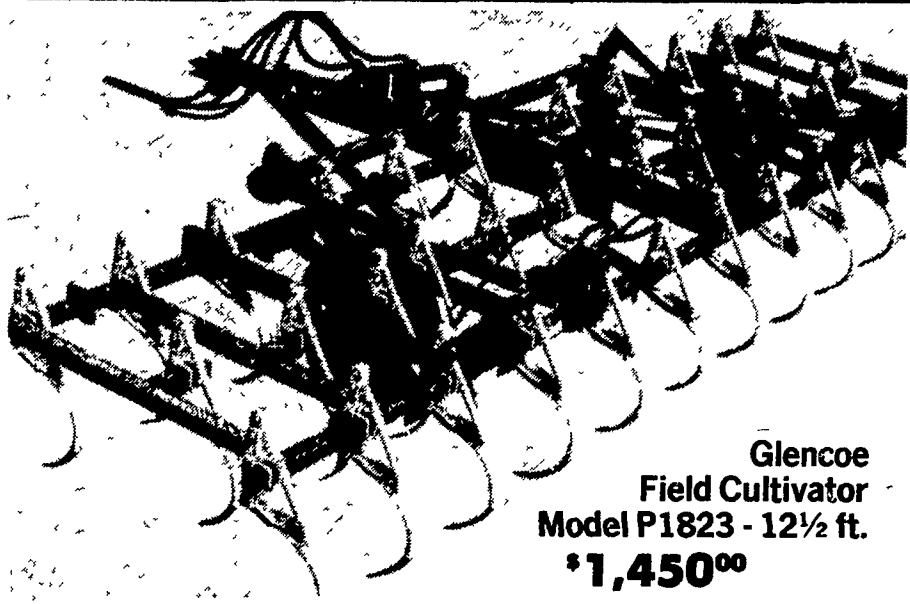
Glencoe Field Cultivator Model P1823 - 12½ ft. $1,450 00

R D #2, HONEY BROOK 1 mile West of Honey Brook on Rt 322 then North on Reservoir Rd Call 215-273-2943 or 273-9730