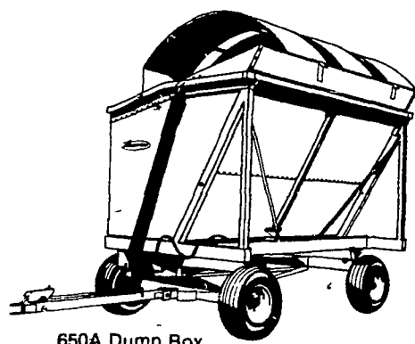
650A Dump Box

Tough hauling jobs are no problem with these new, efficient dump boxes. Three box sizes and two styles give you the versatility you need for your operation. Model 650A comes with a roof as standard equipment, and is especially designed to use for corn silage, haylage, and dry chop material. Models 650S and 650T are normally used for seed corn, sweet corn, sugar beets, and similar operations. All three models feature a pair of high capacity cylinders that quickly lift box evenly to dumping height. See a dump box that suits your needs at your Avco New Idea dealer.