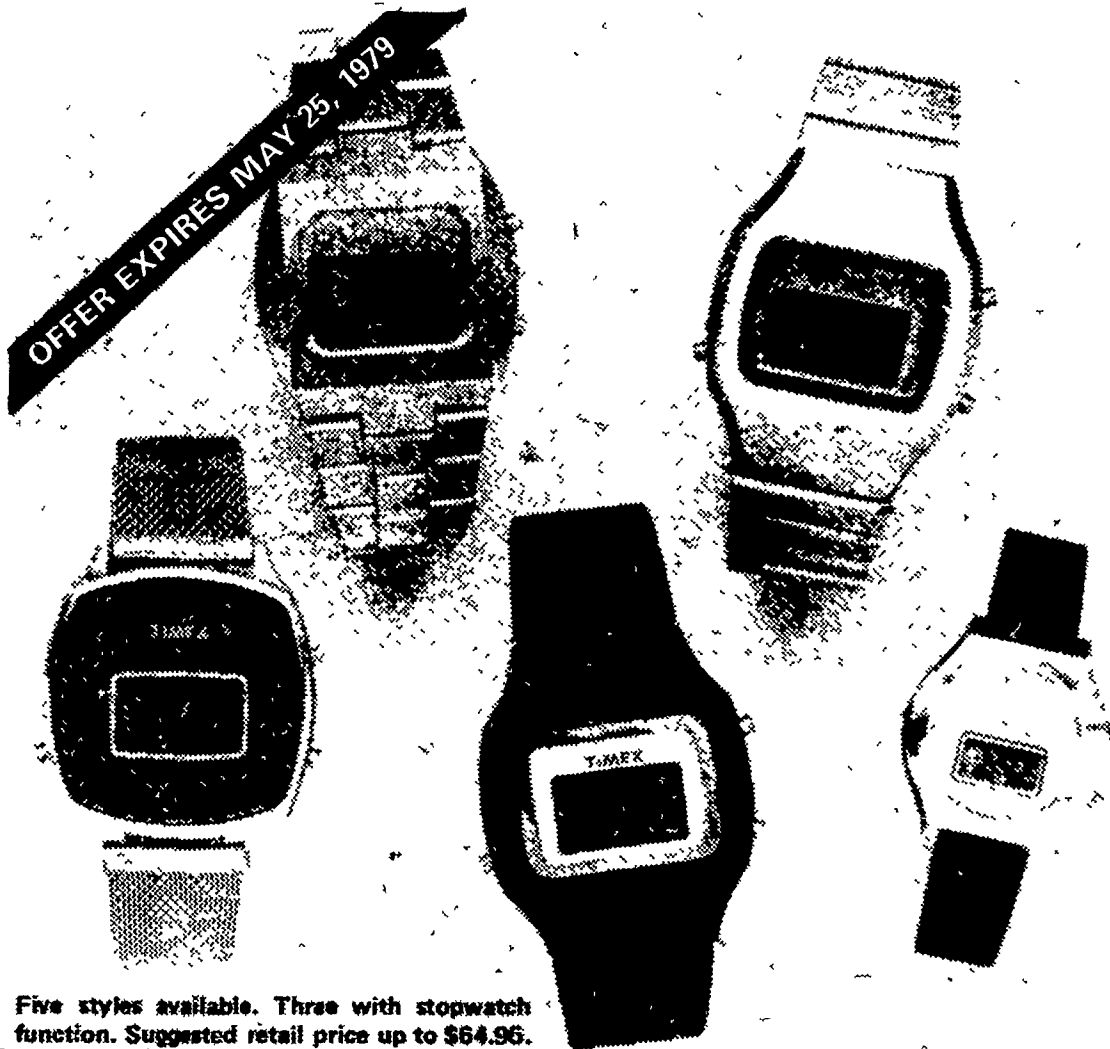
Five styles available. Three with stopwatch function. Suggested retail price up to $64.95.

Choose your free Timex LCD Watch when you finance* your next new or used car, van, or small pickup with Farmers First Bank. Offer available at any Farmers First office or these participating dealers.