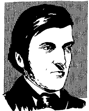
For what avail the plough or sail, Or land or life if freedom fail?