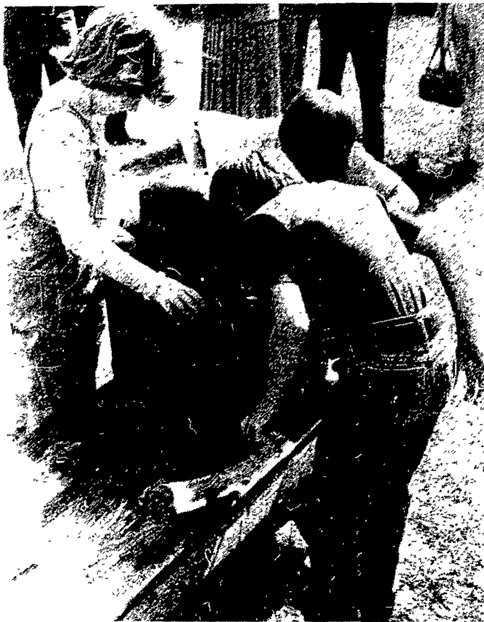
Apple bobbing was a popular event for the younger set at the Apple Blossom Festival. Youngsters gathered around the old wooden tub for a chance to get their faces wet as they tried for the elusive apples.