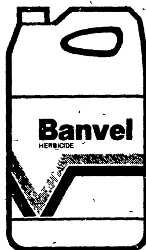
Before using any pesticide, read the label

Call Agway for Banvel and other crop protection needs