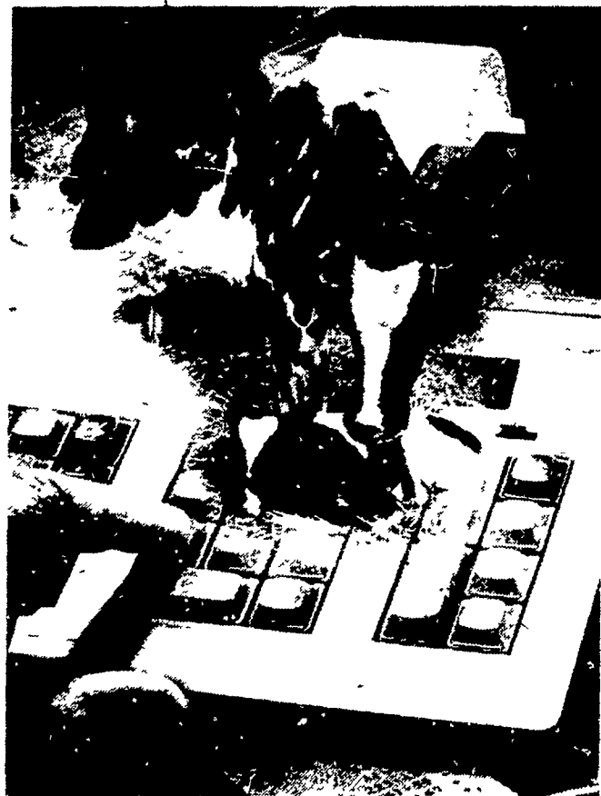
Figure it for yourself.

CALL COLLECT TO JACK McMULLEN 717-761-1863 OR WRITE SHARON METAL BUILDINGS 1500 STATE ST., CAMP HILL, PENNA. 17011