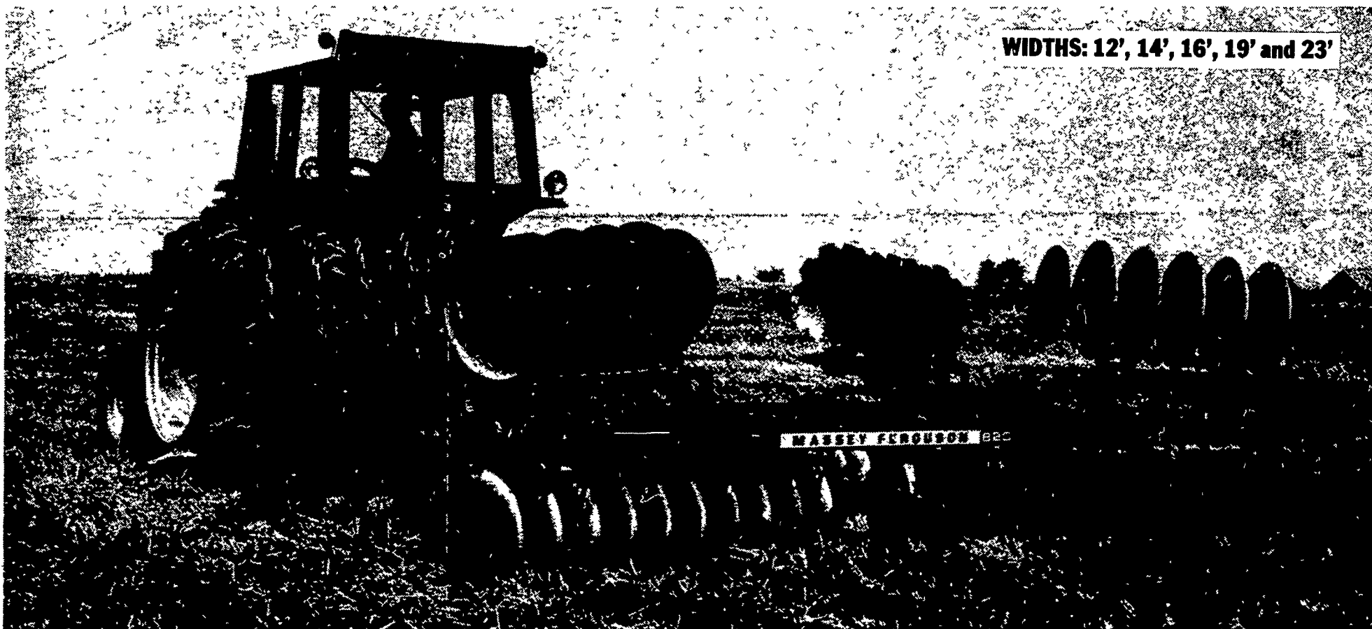
WIDTHS: 12', 14', 16', 19' and 23'