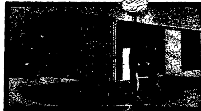
Ag-Master® 2:12 BUILD