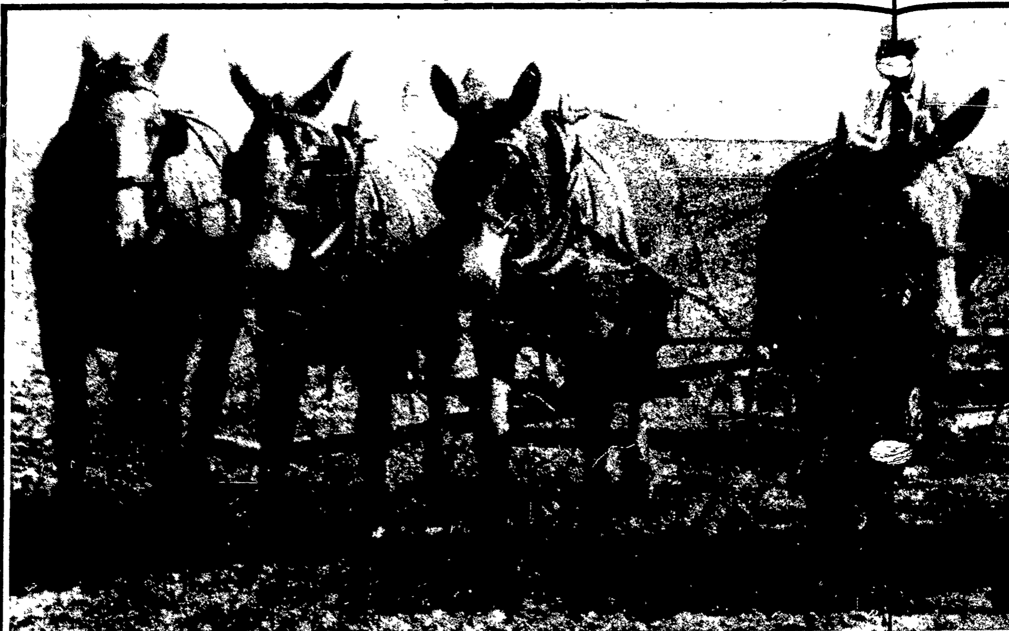
As Spring grows warmer, the farmers continue their field work, preparing the ground for the c.

Cattle and calves on feed or slaughter market in the 13 major feeding states on April 1 totaled 11.1 million head. Placements during the January-March quarter totaled 5.88 million, down nine per cent from the comparable quarter last year but five per cent above the same quarter in 1977. Marketings of fed cattle for slaughter during January-March totaled 6.77 million, slightly below the record 1978 quarter marketings. During the April-June, cattle feeders intend to market 6.35 million head, four per cent below the second quarter marketings in 1978 but three per cent more than 1977.