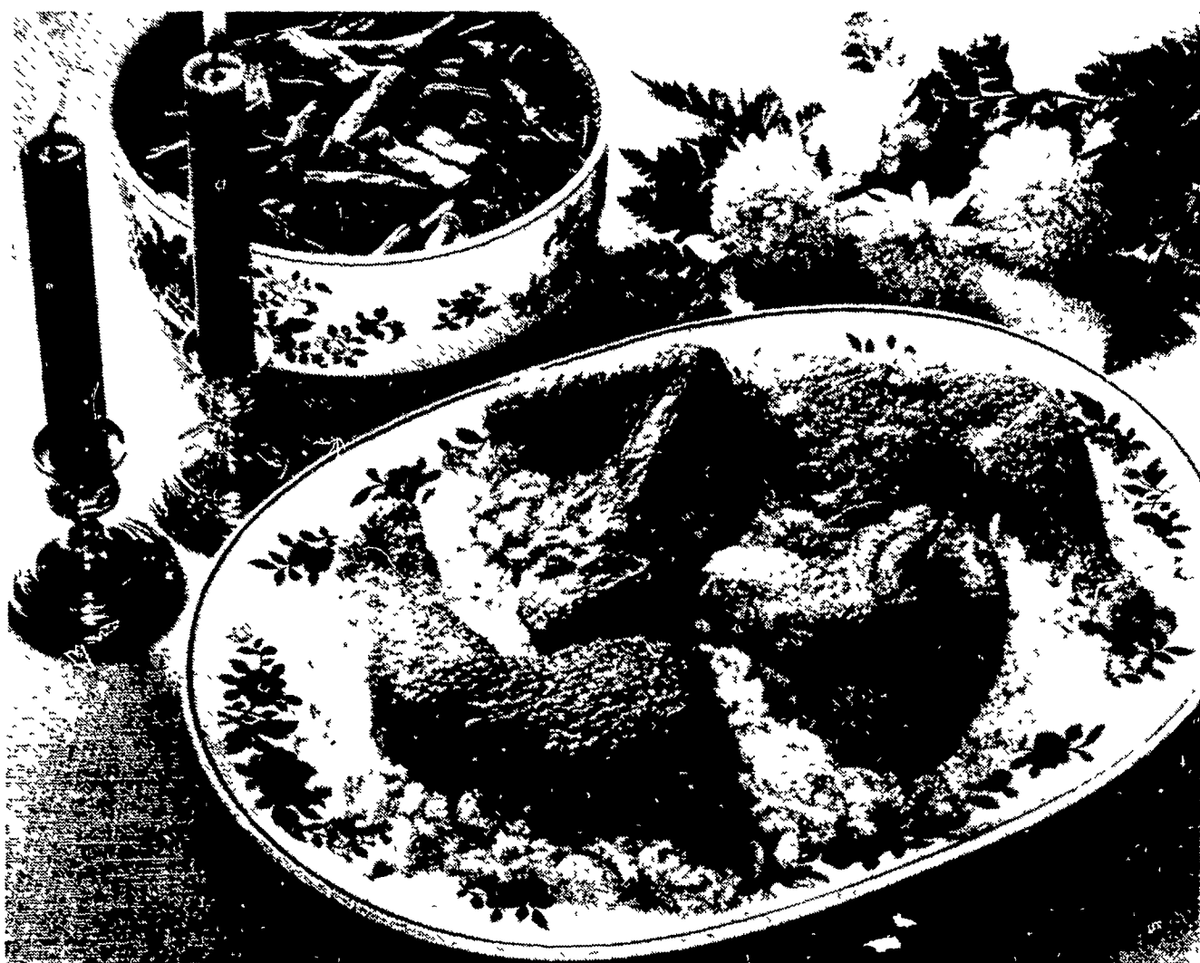
To turn an everyday favorite into a gourmet dish, one can try the Chef's Chicken Deluxe, which is seen above.