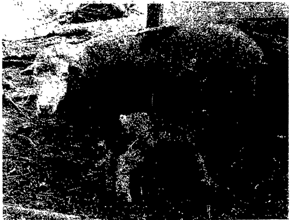
Sheep producers in Pennsylvania may soon have the opportunity to vote in a statewide referendum to support the establishment of ovine medicine facilities at the U. of P. veterinary school. The establishment of such a facility would be to improve the veterinary services to sheep producers.

Under the procedures for holding a commodity referendum, the producers must first submit a proposal requesting a referendum to the Secretary of Agriculture. The Secretary will then schedule one or more hearings. At the hearings, producers have the opportunity to speak for or against the referendum. Following the hearings, if the Secretary deems the project worthwhile with substantial support, the Department of Agriculture will prepare and send out ballots to all producers in the state.