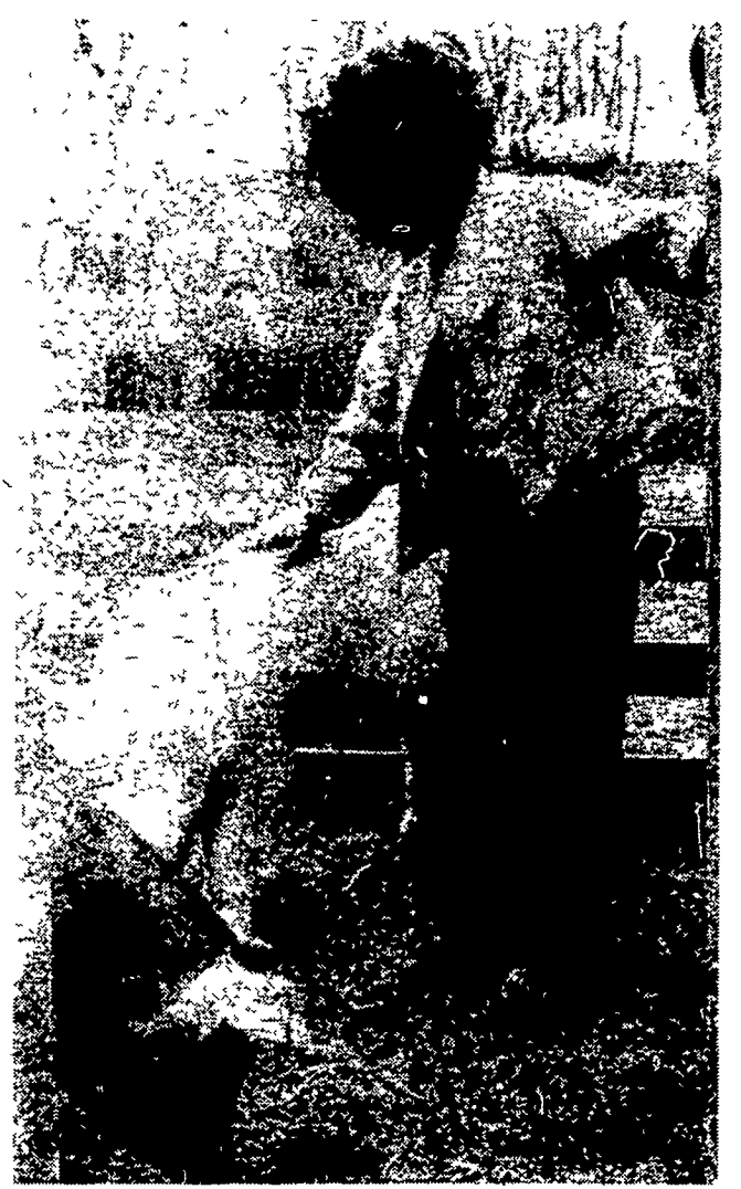
Shy but curious, this little girl reaches out to pet the pigs.

This was the third year for the Manor Chapter to put on such a petting zoo. As one FFA'er commented, "the kids seemed to really enjoy it."