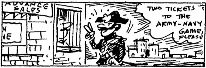
In the 1800's Sam Carter became a major general of the U.S. Army and a rear admiral in the U.S. Navy.

Higher machine capacity in tons of hay baled per hour makes it easier to snatch the crop ahead of the next rain. Mechanized handling makes it easy to clear large tonnages from large fields quickly and with minimum labor.