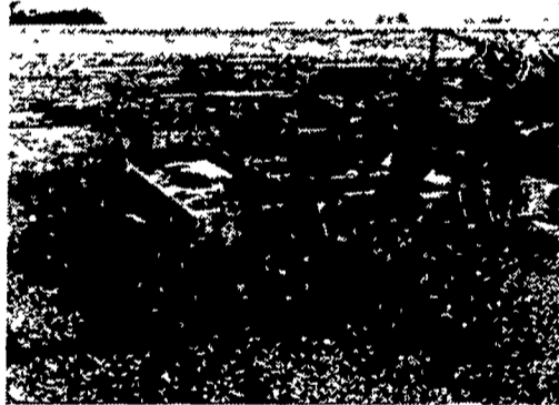
Brady 9 Tooth Chisel Plow ..... $1,050.