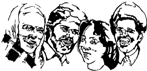
4-HAPPENS AROUND THE WORLD