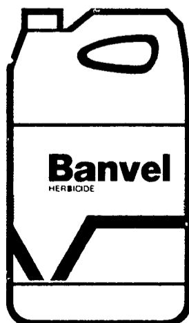
Before using any pesticide read the label

Call Agway for Banvel and other crop protection needs