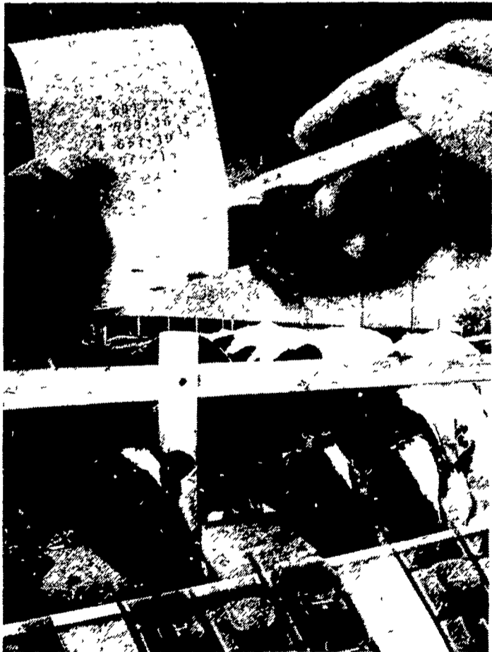
Figure it for yourself. When you shortchange their nutrition, you shortchange yourself.

Looking for ways to cut on out-of-pocket feed costs without cutting down on milk production? Cutting production costs will backfire if you end up shortchanging your herd's nutrition in the process.