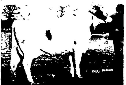
Dau.: Bun-Yard Smoker "GP"(84) 2-02 2X 365d 17164M 36% 618F

Siring high producers with smooth fore udders and improved teat size and placement