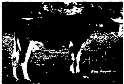
Dau · Sageser C Astro Pugie "VG"(86) 4-06 2X 63d 4330M 46% 201F(Inc) 4 06 Projected ME 15767M 707F

The breed's highest PDM test improver Siring tall, stylish daughters with snug udders.