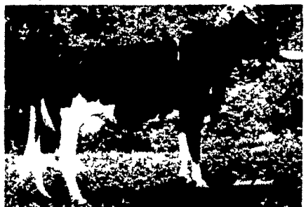
Dau · Ransom-Rail Pacemaker Sherry "VG"(86) 2-05 2X 365d 25643M 35% 885F

Pacemaker daughters have it all—beautiful udders, strong feet and legs, and great will-to-milk