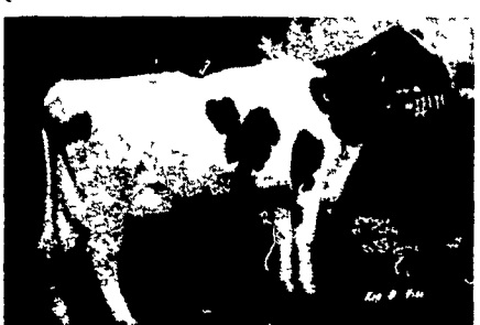
Dau.: Wheeler Farm Fran "VG"(87) 5 08 2X 365d 31480M 36% 1067F 5-08 Projected 26680M 871F

A top son of Chief one of the breed's best udder improvers siring high producers