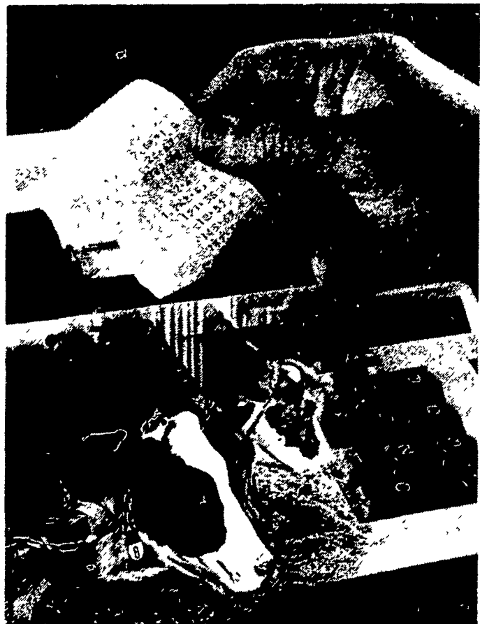
Figure it for yourself. You keep milk production up and feed costs down with our dairy pre-mixes.

Wouldn't you like to put some of that money you spend on commercial protein supplements in your own pocket?