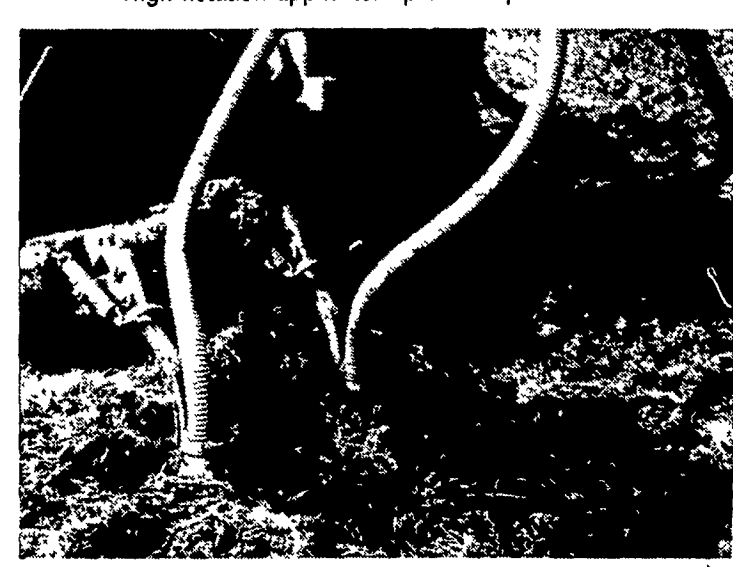
Liquid waste injections reach 8 inches below ground.