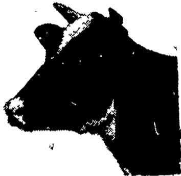
Mount Joy, Pa. 17552