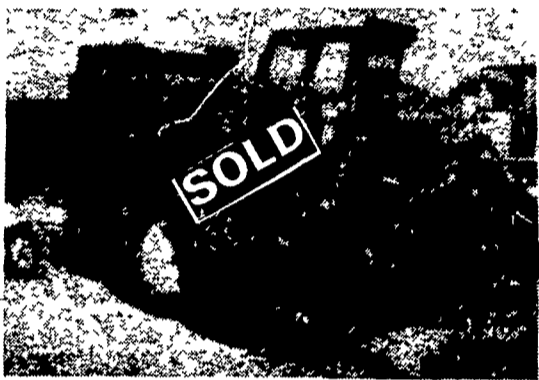
MF 410 Diesel Combine w/Cab, 13' Platform, 3 row N.R. Corn Head. . . . . $8,250

We have been selected to be a John Deere Engine Distributor . We will be stocking and distributing engines to be used as stationary power plants or as repower applications in John Deere tractors, combines, and self-propelled equipment. Please call us for your power requirements.