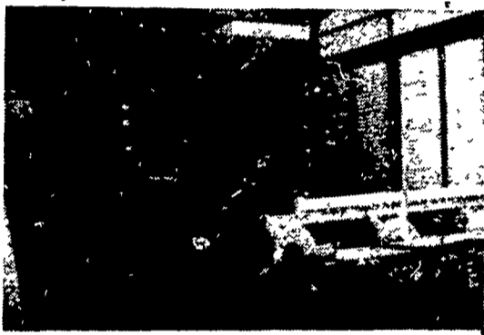
JD 4400 Diesel Combine w/213 Flex Head & Auto. Header Height Control (500 Hrs. - Like NEW). $29,750