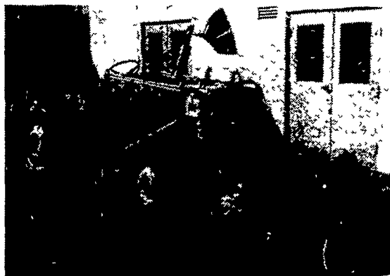
International 3414 Tractor & Loader ..... $3,750.

We have been selected to be a John Deere Engine Distributor . We will be stocking and distributing engines to be used as stationary power plants or as repower applications in John Deere tractors, combines, and self-propelled equipment. Please call us for your power requirements.