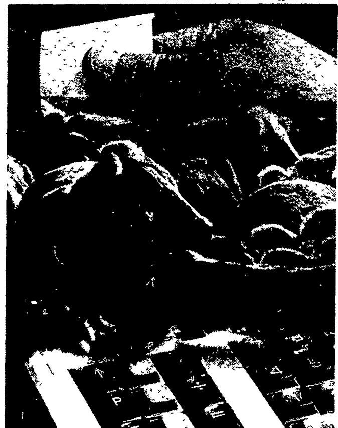
Figure it for yourself.