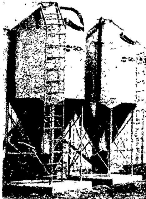
SCHULD BULK STORAGE BINS

SEE OUR DISPLAY AT THE PA FARM EQUIPMENT EXPO