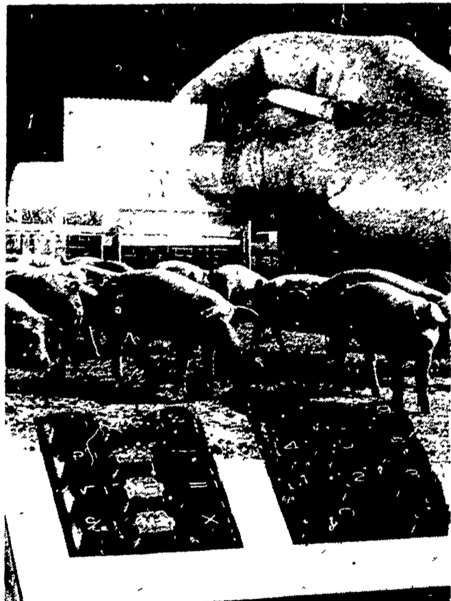
Figure it for yourself. You save money, day after day, with corn-soy and Vigortone.

720 N. PRINCE ST., LANCASTER, PA. PHONE: 717-393-1701