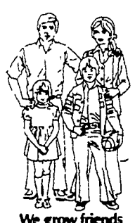
We grow friends

AGWAY INSURANCE AUTO · HOME · FARM · LIFE · HEALTH